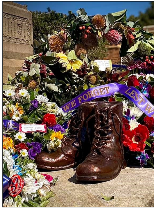
April 2021 the boots after Anzac Day.

(The boots have been removed this morning and will be professionally installed on Monday)