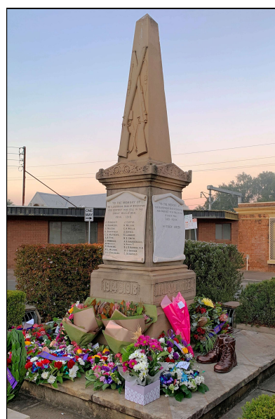
The newly unveiled boots on Anzac Day.