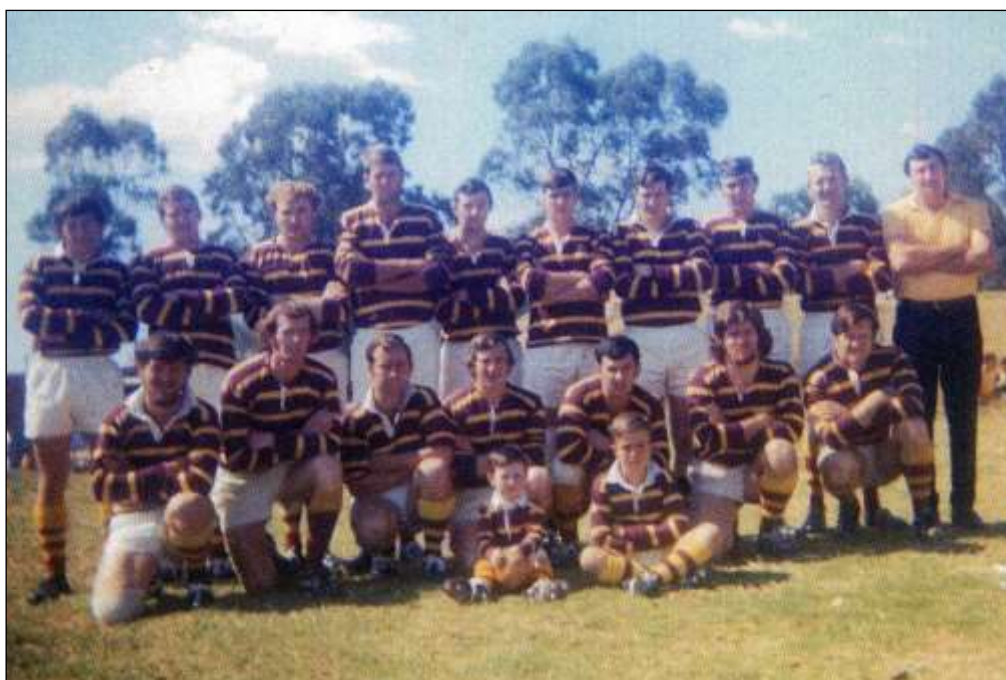
Riverstone A Reserve Grade Premiers 1971.