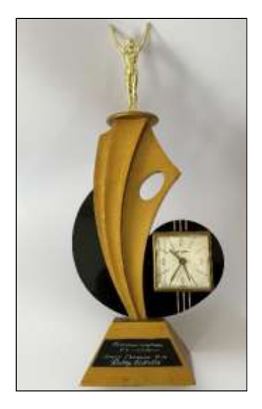
1970 Grand Champion trophy.