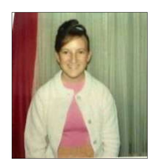
Ready for Physie.