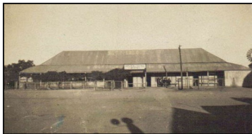
Imperial Hotel at Adavale, Queensland, ca. 1928.