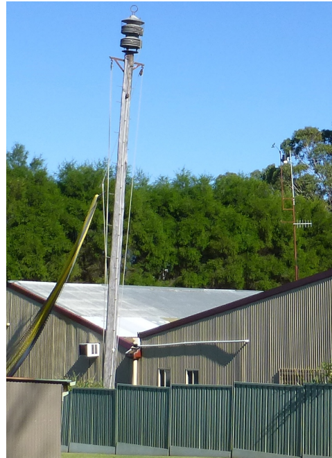
Oakville Rural Fire Brigade siren on pole at the back of their headquarters in April 2013.