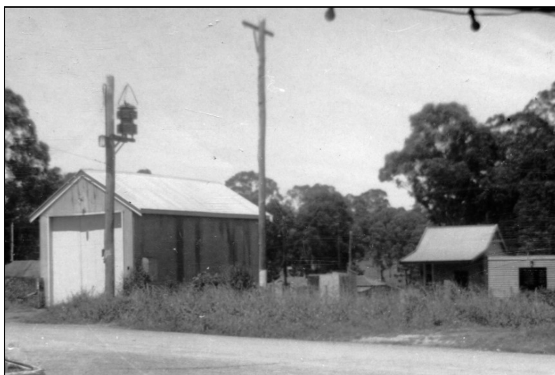
Year unknown, the Schofields Bushfire Brigade shed, showing the siren in place and the old Schofields Railway Station on the other side of the line.