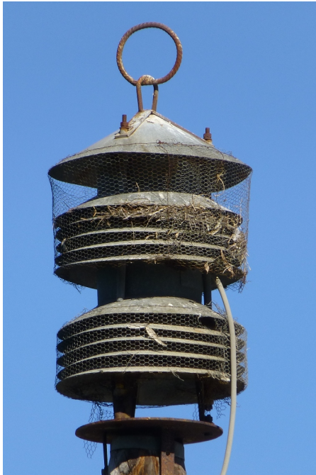
Close up of Oakville Rural Fire Brigade siren in April 2013.

The Windsor and Richmond Gazette 6 March 1946 reported that the Richmond Council was unsuccessful in requesting to keep the siren and triple set of hooters used at Richmond. Later that year the Gazette of 27 November 1946 reported that the Windsor Council was granted permission to hand over their remaining NES siren to Oakville Bush Fire Brigade.