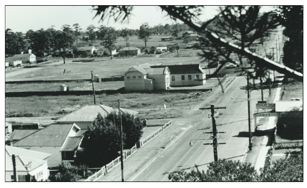
Looking up Garfield Road towards the Museum (which was then the Masonic Hall).