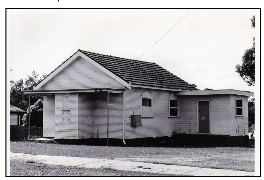
St Peter's Schofields.

Finally in 1959 it became possible to build a new Church.