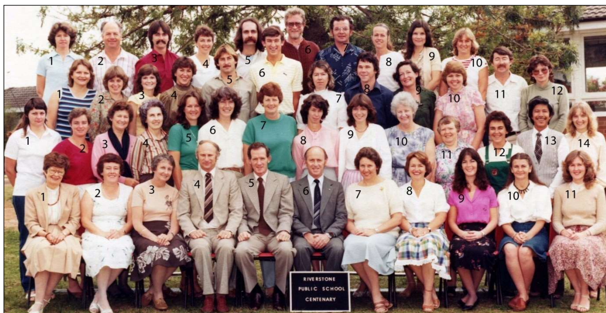
Riverstone Public School Centenary Staff photo taken in Term 3 1982.