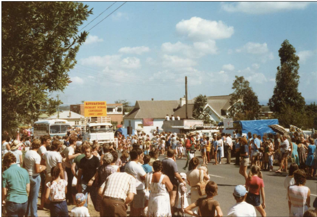
The Riverstone Public School float passes the Museum in the O'Connell County Fair parade.