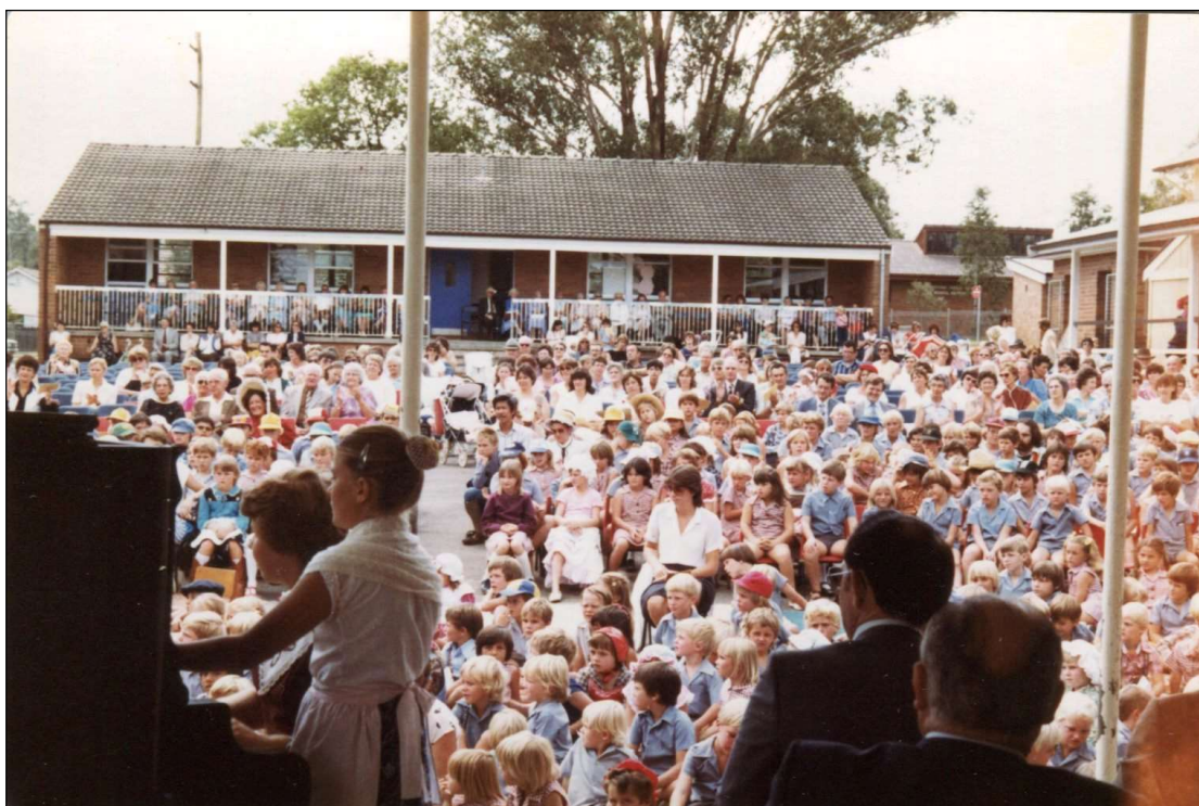
A substantive crowd gathered for the official events on the Friday.