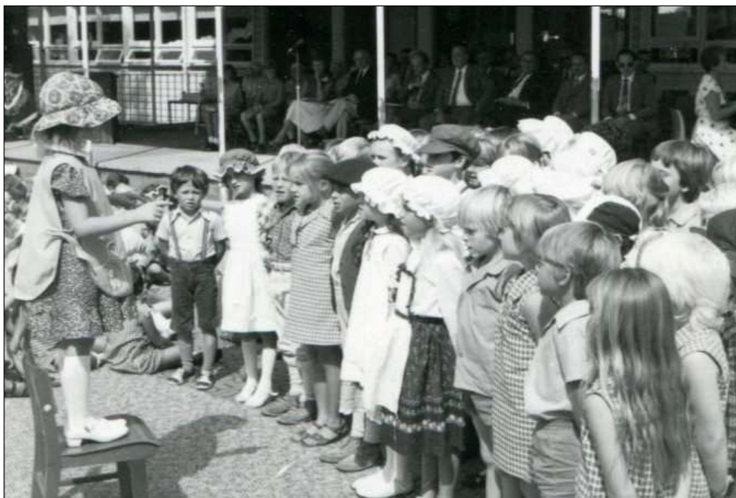
Choir singing choral item.