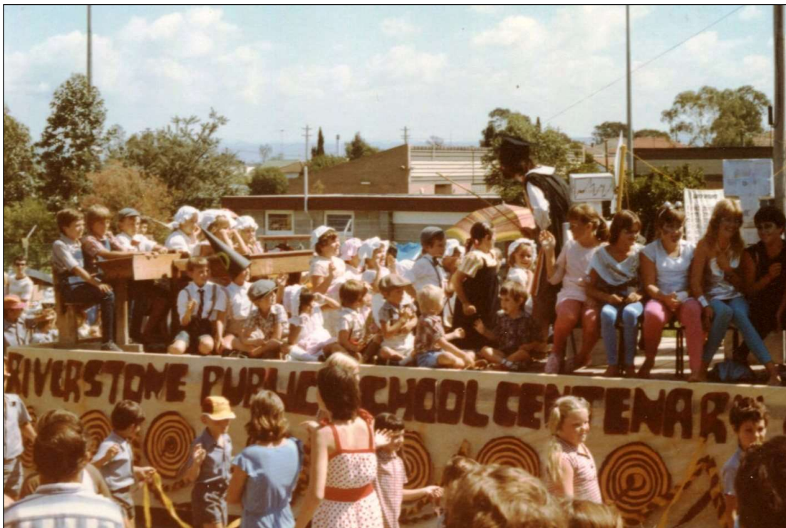
The Riverstone Public School float in the Parade.