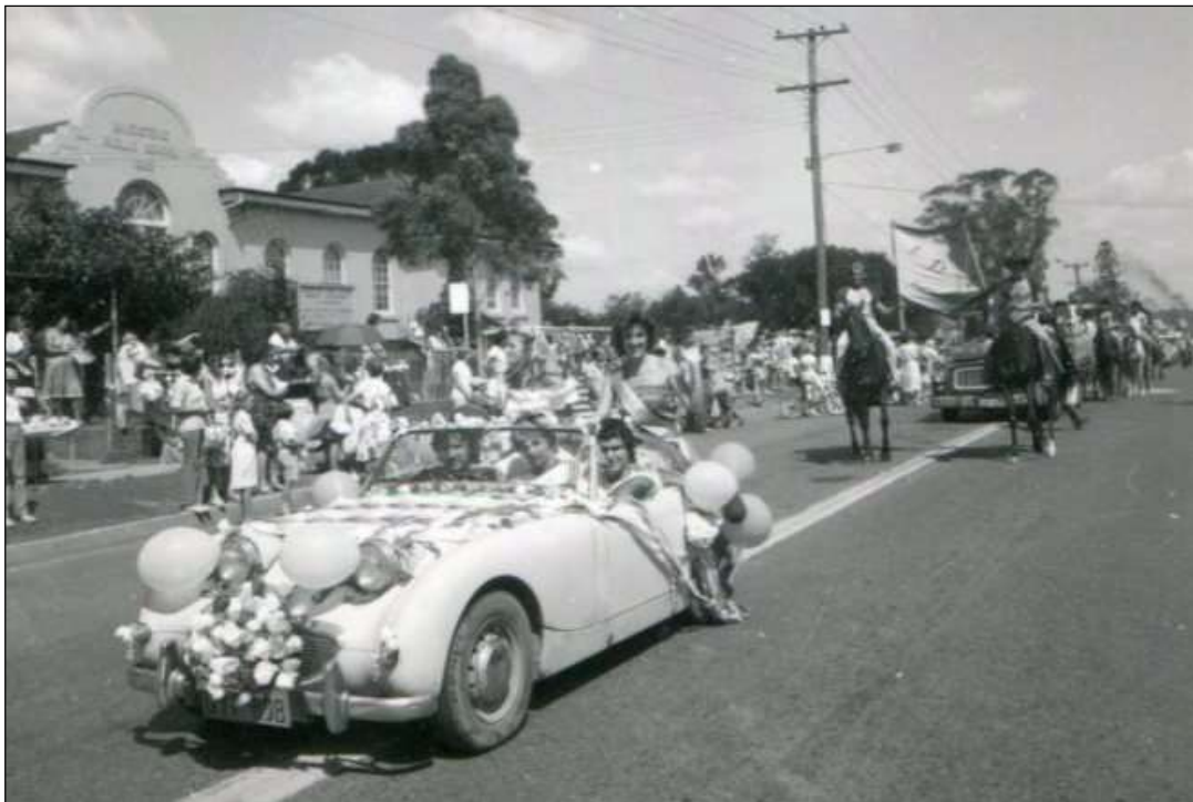
The winners of the Historical Society awards featured in the O'Connell County Fair parade.