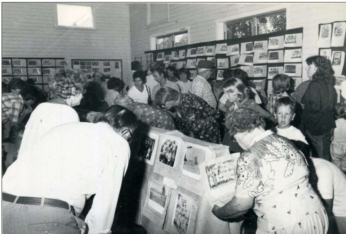
The historical displays were a popular part of the celebrations.