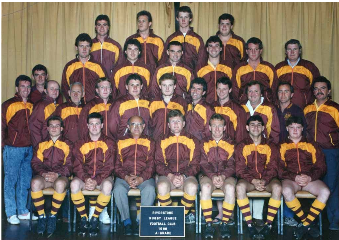
Riverstone "A" Grade Premiers . 1988

His best memories of the club include -the presentation days for the kids at the end of the season, the trips away with the kids teams, selling raffle tickets at the Tourmaline Hotel, the selling of doubles on the Commonwealth Bank corner on Friday afternoon and Saturday morning. He also has good memories of the Bowls days and socials held at the Bowling Club, the barbecues after the home games and the many celebrations held in the footballers hall.