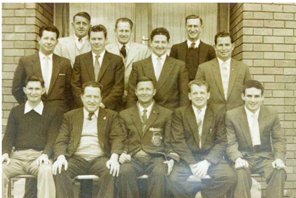
Riverstone Junior Rugby League Club Committee