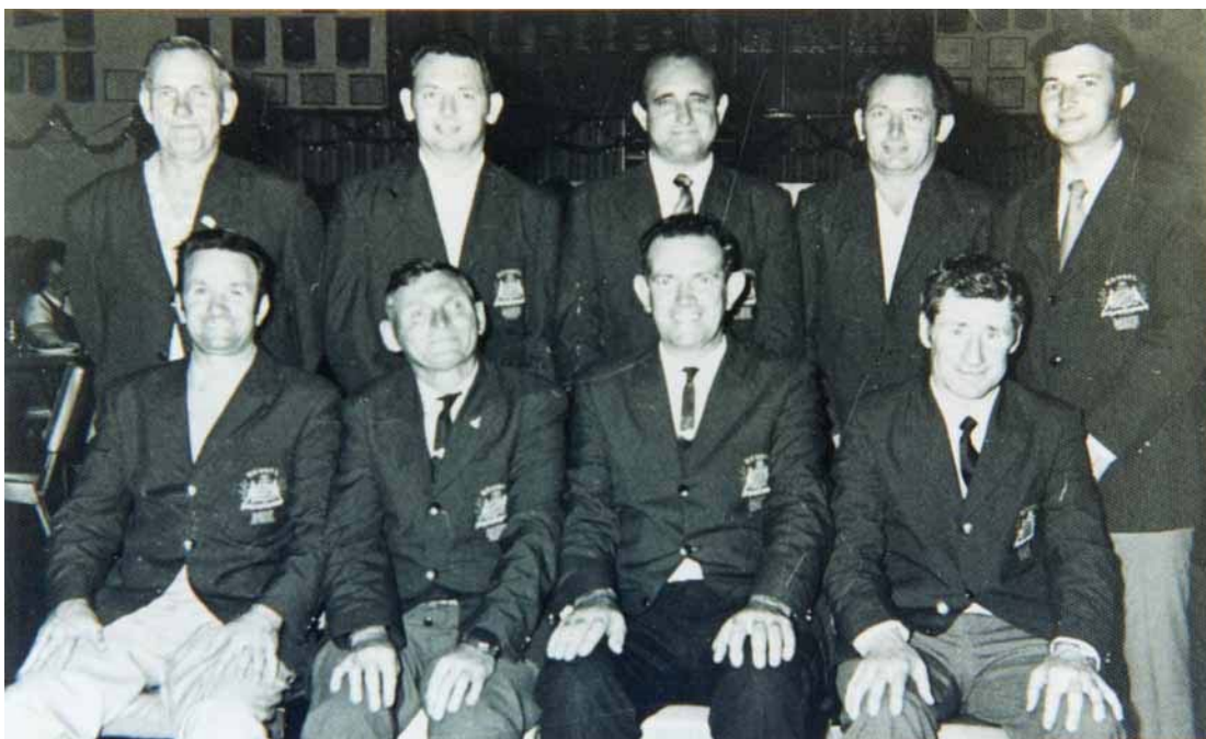
Riverstone Rugby League Club Life Members