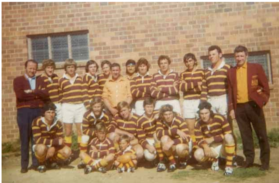
Riverstone 'A' Grade Premiers 1971