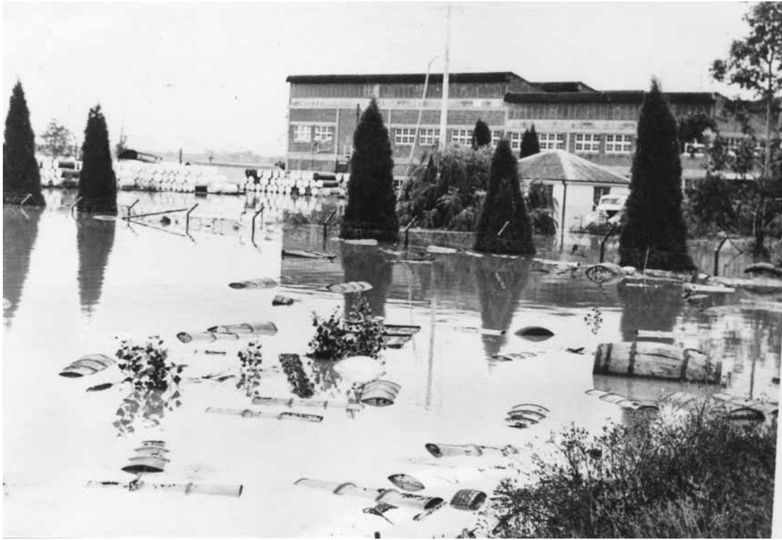
1956 Flood, showing the textile building at Riverstone Meatworks.