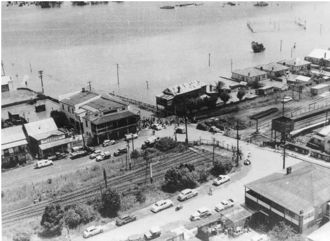
1956 Flood, arial photo showing railway terrace, the railway crossing and Garfield Road West.