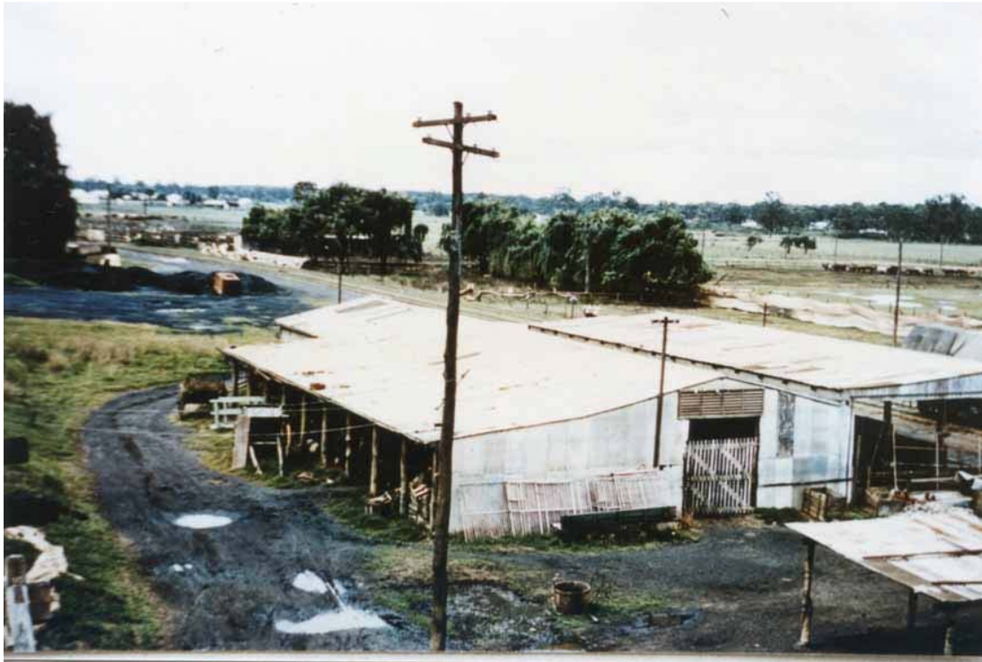
1961 Flood before and after photos (6 weeks apart) taken from the top of the old skinsheds looking over the stables behind the Riverstone Meatworks.