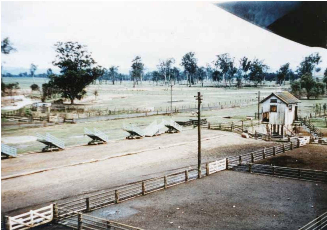
1961 Flood before and after photos of the sheep-unloading yard (behind the old Skinshed) at the Riverstone Meatworks.