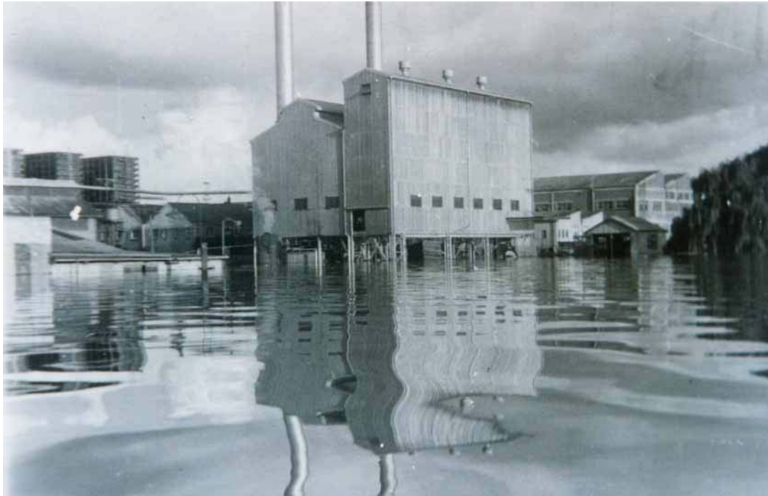
1961 Flood, showing the boiler house and textile plant at Riverstone Meatworks.