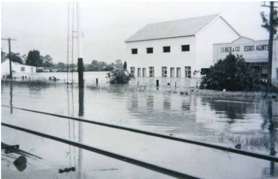
1961 Flood, looking across the railway line towards West Parade.