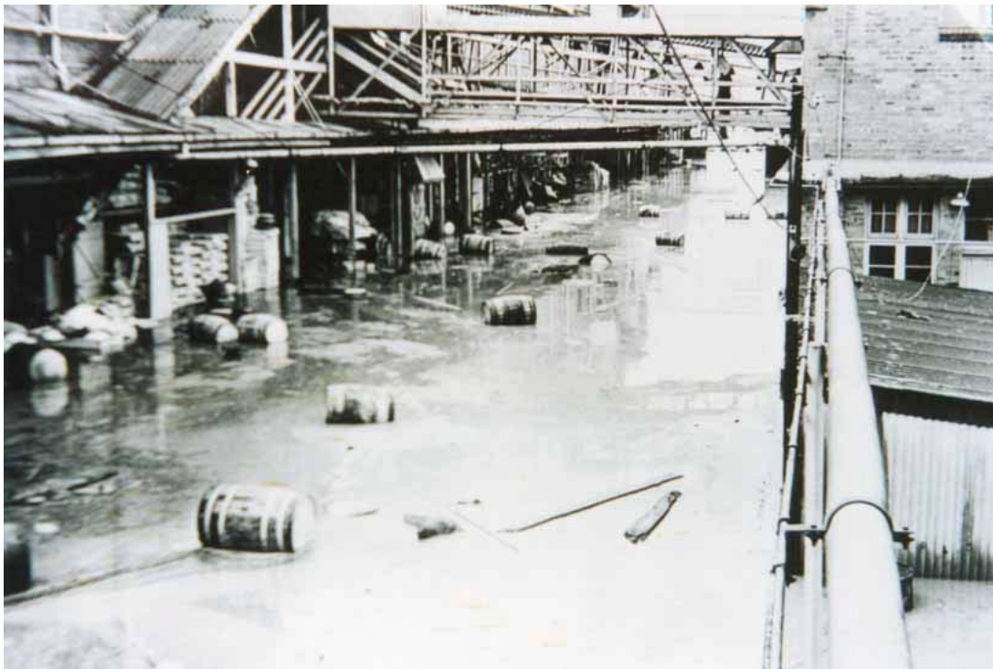
1961 Flood, showing Freezer lane at the Meatworks.