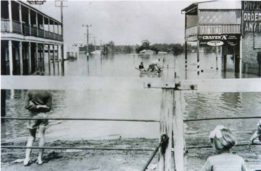
1961 Flood, looking down Garfield Road West, Riverstone hotel on the left and the meatworks local sales shop on the right (now the vet nary clinic)